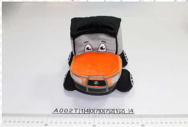
Photograph of Sample