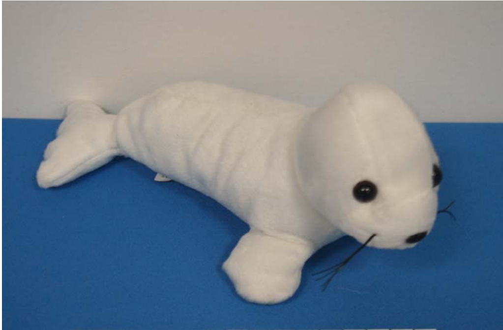
9" WHITE SEAL